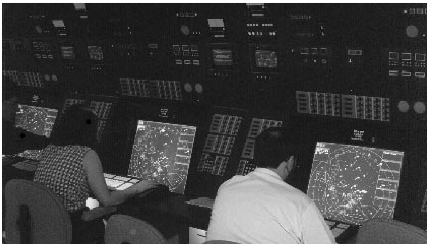
Figure 1: STARS Workstation